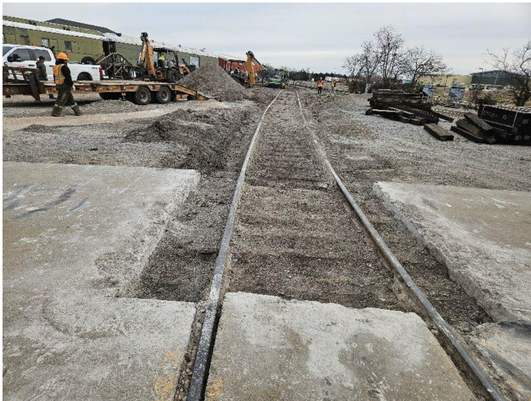
Farm Rail crew working on railyard track realignment