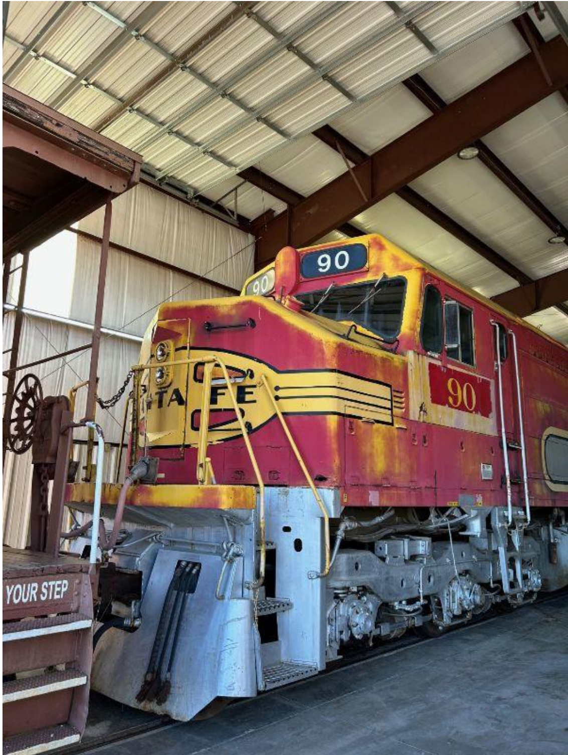
Santa Fe 90 is moved inside the shop for new paint