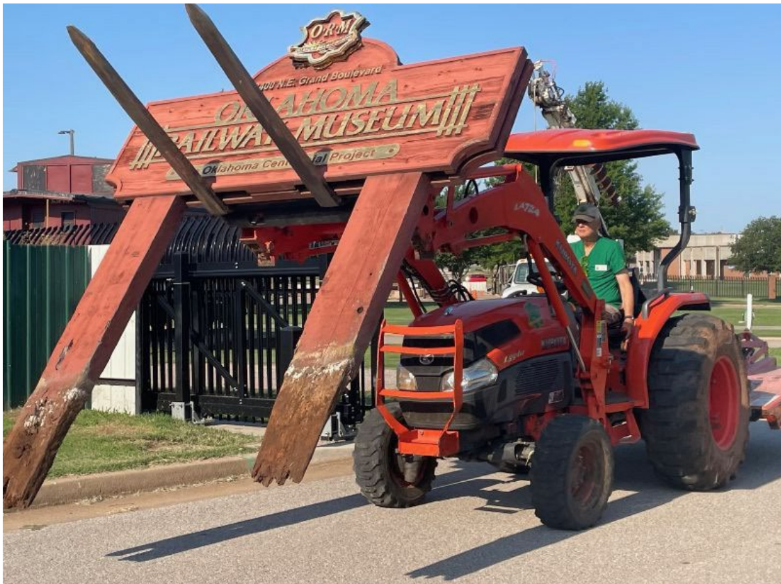
Volunteers Jerry Gore and Jay Chilton (not pictured) remove the museum's old entrance sign. The sign will be refurbished and installed at another location.