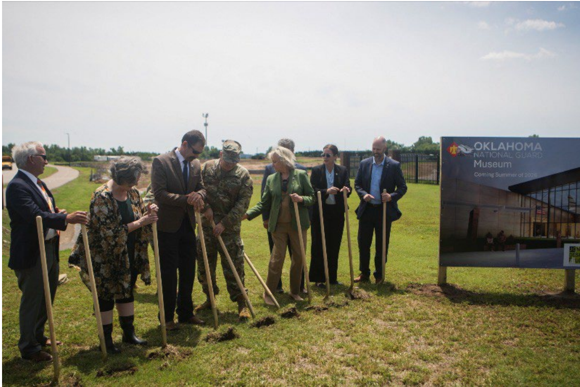
The ORM Staff and volunteers attended the Groundbreaking of the Oklahoma National Guard Museum