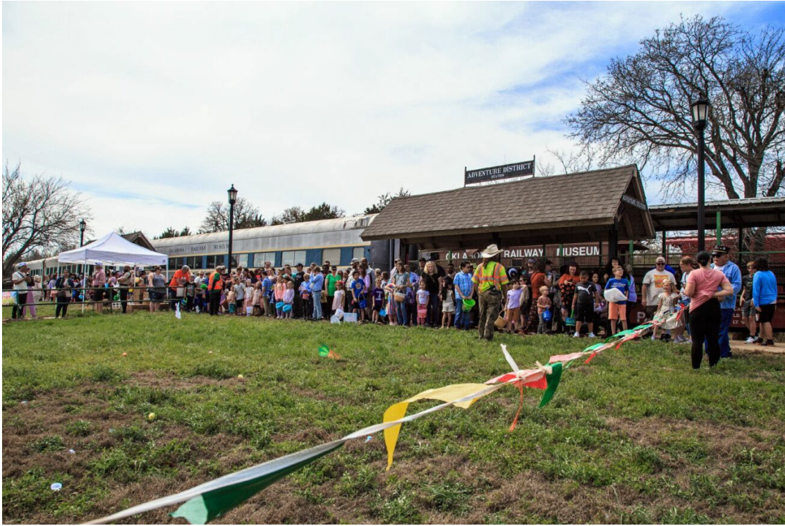
The museum had a great turn out for the Annual Easter Train, March 30th.