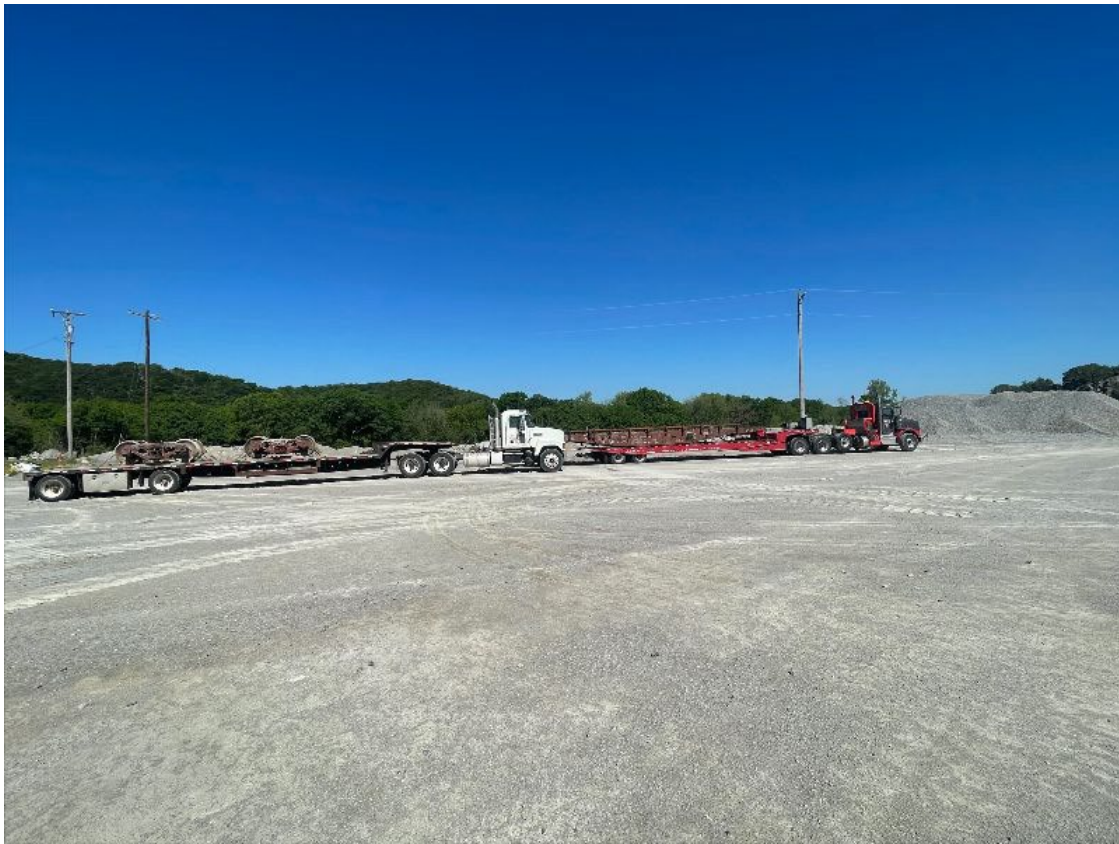
J & B Heavy Haul transported our 1929 AT&SF Flat car out of Big Canyon. The flat car was donated by Dolese to the museum and will eventually carry our Santa Fe piggyback trailer. The flatcar is stored at their yard until we can schedule movement to the museum