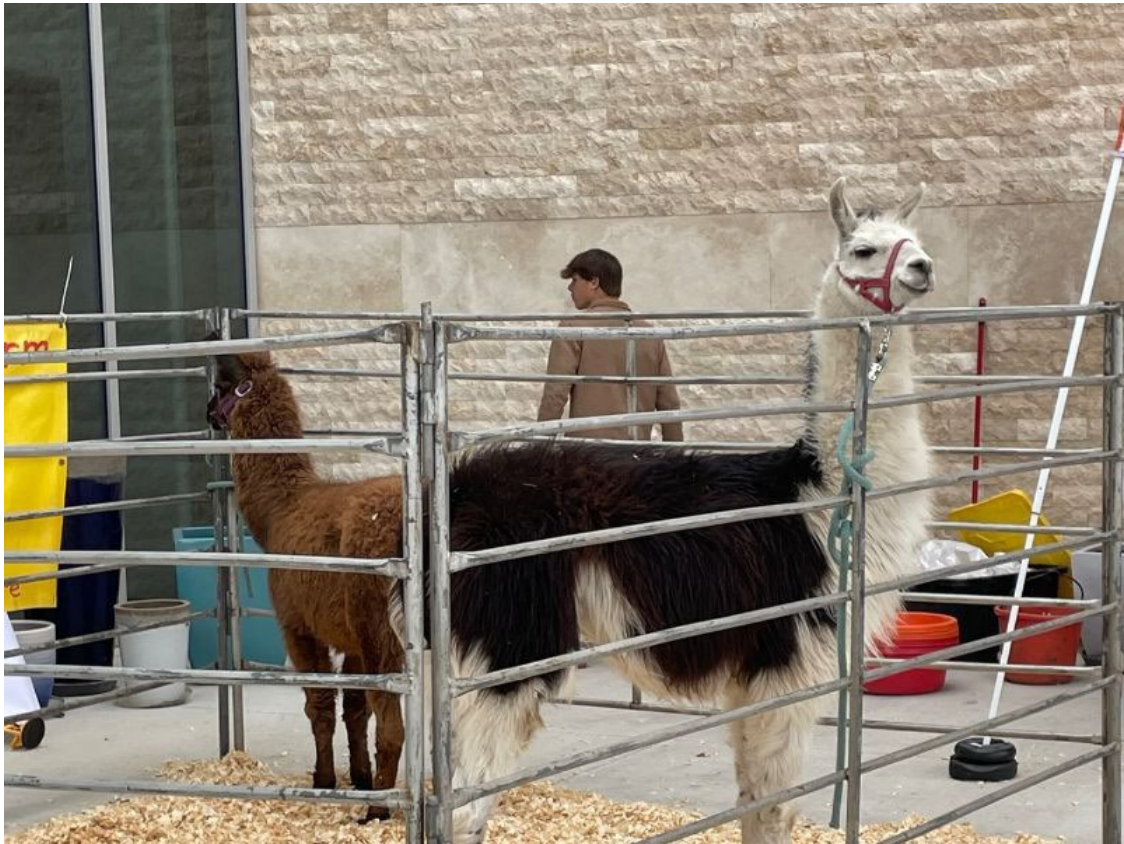
Llama and Alpaca at Kids' Fest. Not necessarily museum related but very important.