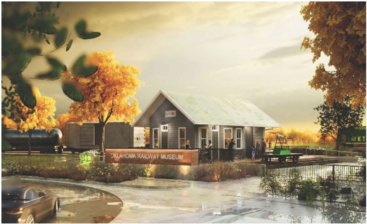
Above is the architect rendering of the new deck and entry feature of the Le Flore depot.