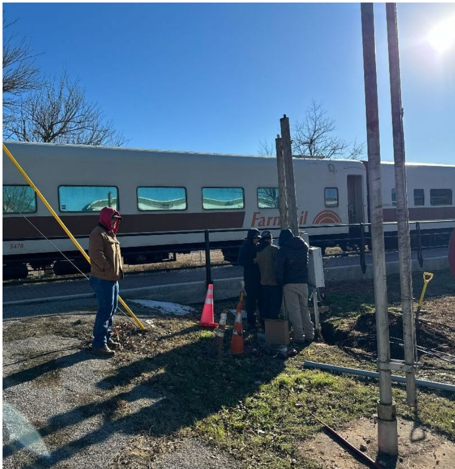
The museum electrical was cut over from overhead to underground on Jan 10th, 2024