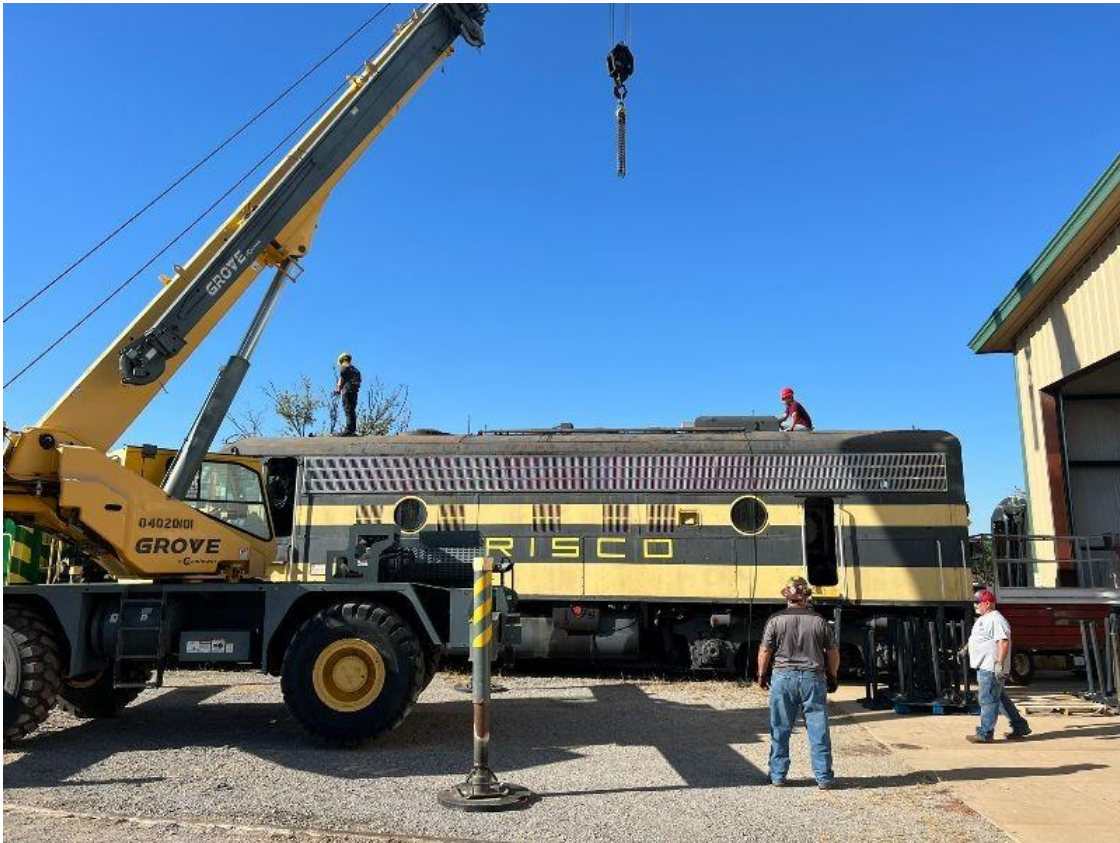
J & B Heavy Haul along with ORM volunteers place the roof hatch and radiators back on locomotive 814.