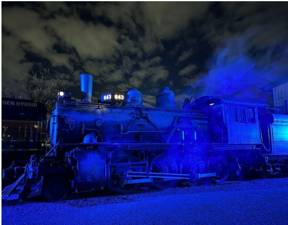
New this year for our Polar Express is the addition of sound and steam (fog machine) to 643. It really makes it seem like 643 could pull the Polar Express!