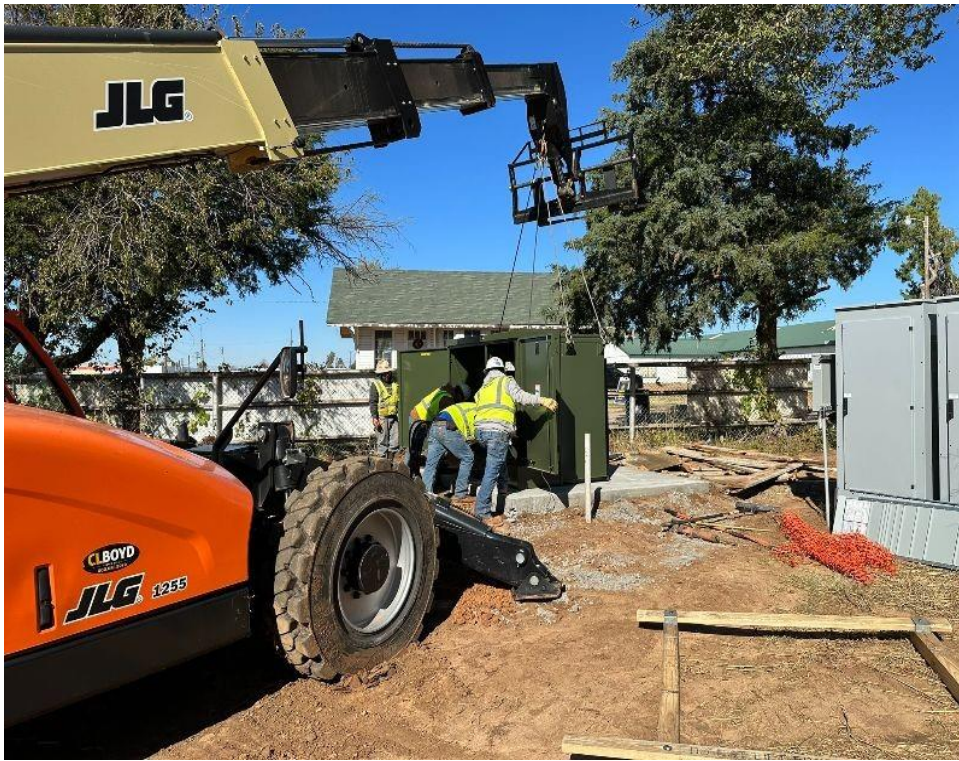
OGE contractor, DrillWorx places our new transformer behind the shop building. Our Electrical upgrade project is nearing completion after almost a year.