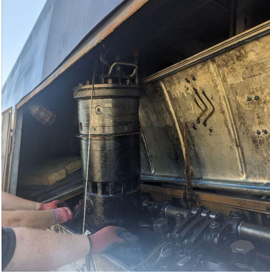
Volunteers Eric Dilbeck and Greg Hall pull a power assembly out of the CF-7 so it can be replaced.