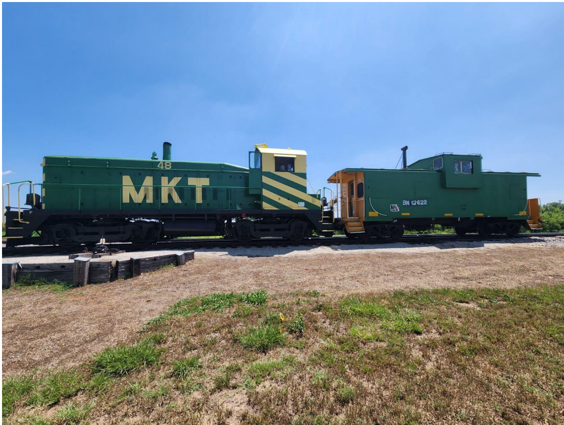
MKT 48 bring out latest acquisition into the museum grounds. Caboose BN12622 was donated by the locally by BNSF and was used as a shoving platform for the OKC switching crews. The caboose was originally Great Northern X-142 built in 1969 and renumbered BN 10062 during the BN merger.