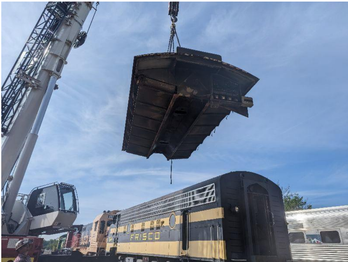
J & B Heavy Haul assisted our mechanical department with the removal of the roof section off of Frisco 814. The radiators are to be replaced and the whole section has to be removed as part of the process.