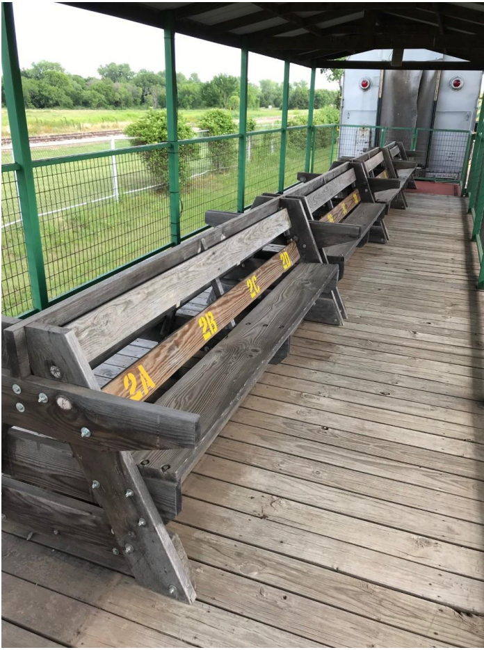
The Open Air Car now has seat numbers to help ensure social distancing.